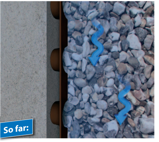
Dimpled sheet without drainage function – intruding water cannot easily drain away.