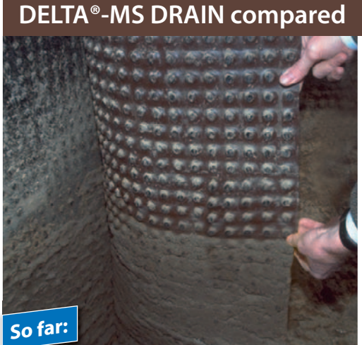
The dimples of many dimpled sheets press against the bitumen coating of cellar walls – a severe stress on the waterproofing.