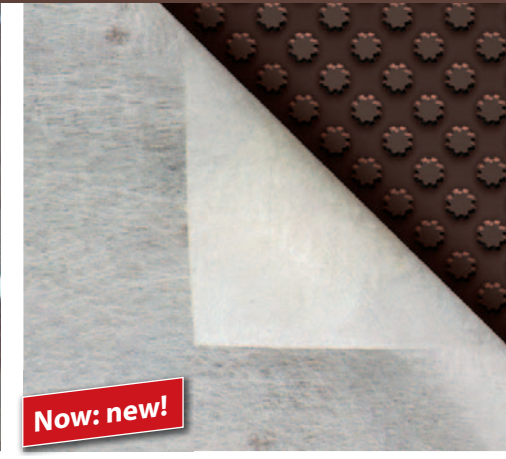
In DELTA®-MS DRAIN sheets, dimples and geotextiles face outward – a great improvement in pressure distribution.